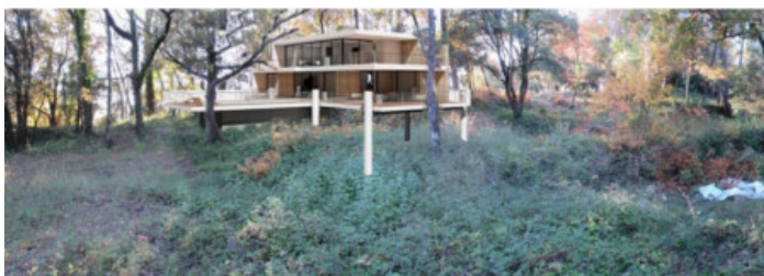
INSERTION du PROJET